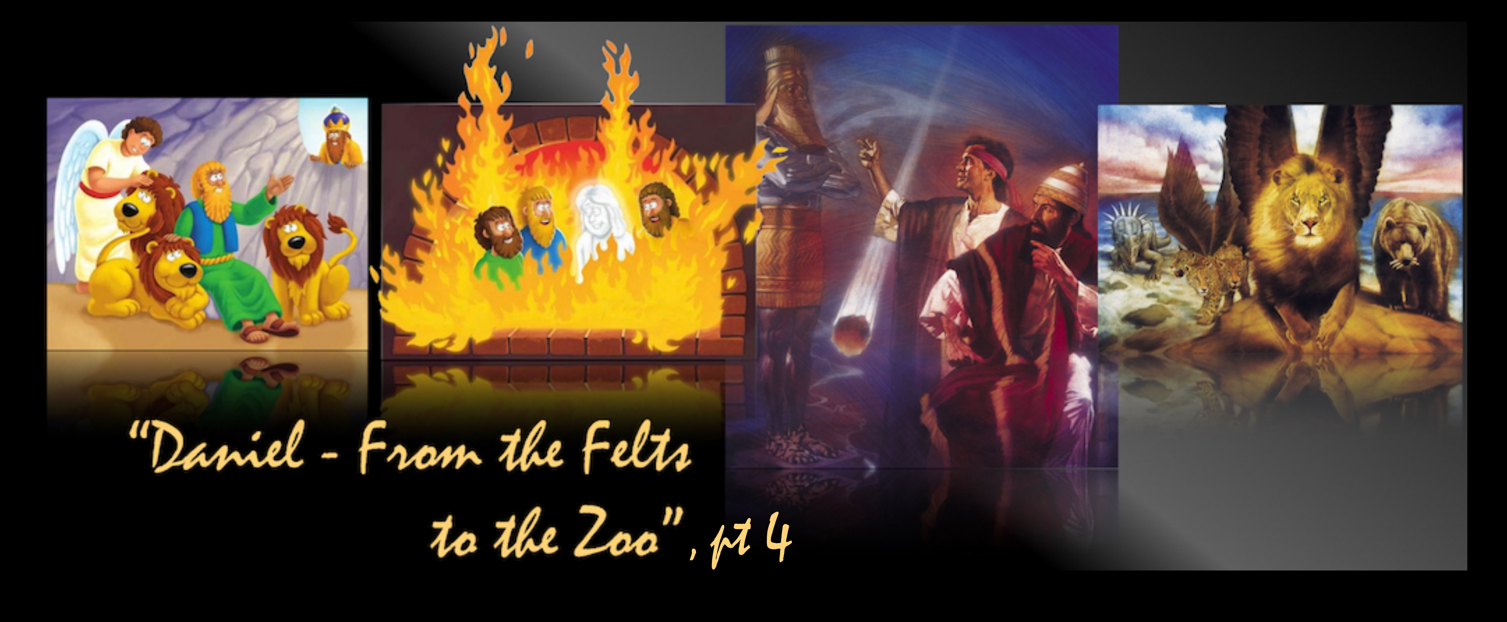
"The king/god Meets the Most High of the Most Low"