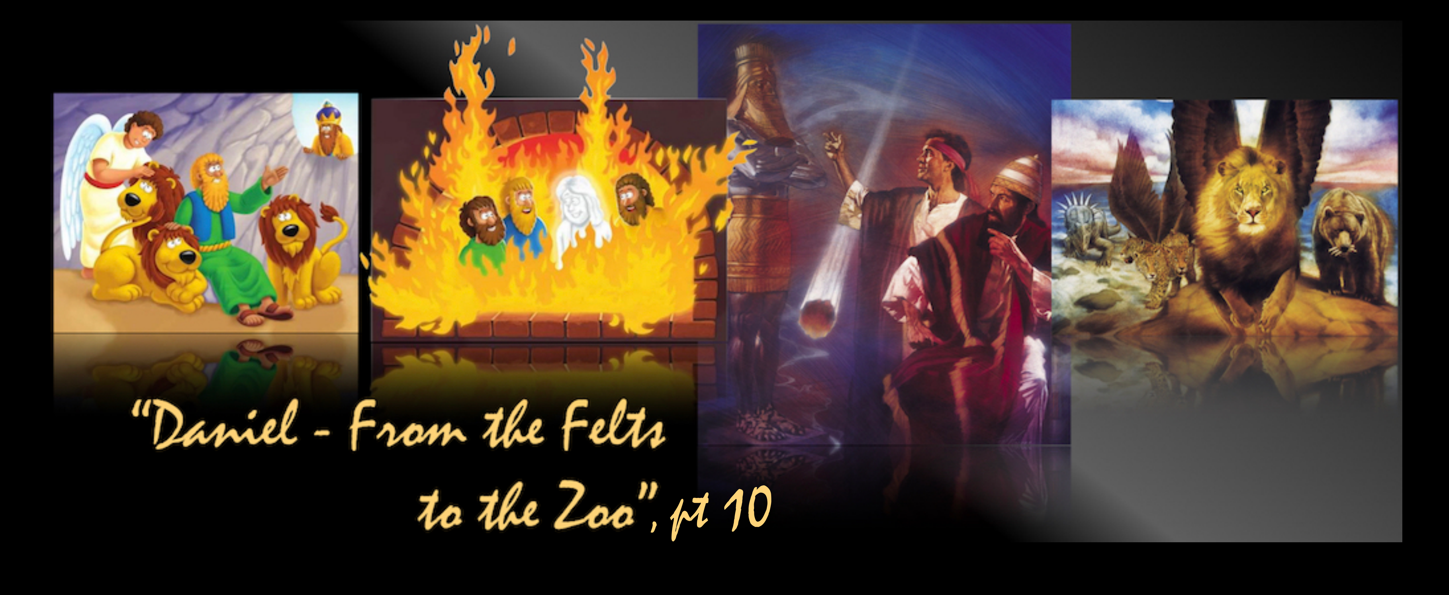
""I Daniel Perceived... F Prayed...'Requiem For a Church"